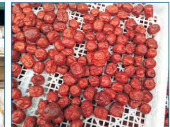
Red date drying