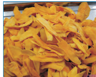
Sweet potato drying