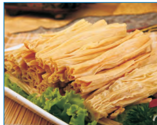
Bean curd stick drying