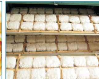
Bean vermicelli drying